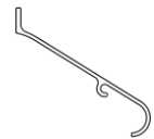
Bull Nose Design

Discharge Coefficient Cd = 0.39 (Class 2)